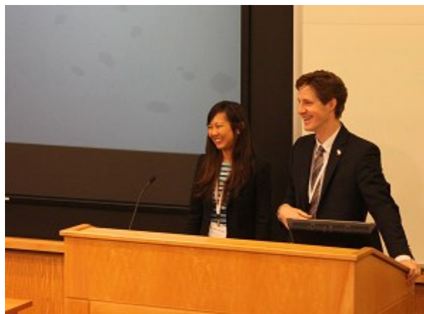
JETAANC Chapter presentation on a membership pipeline

Delegates also reviewed how other alumni groups approach these same topics during a panel