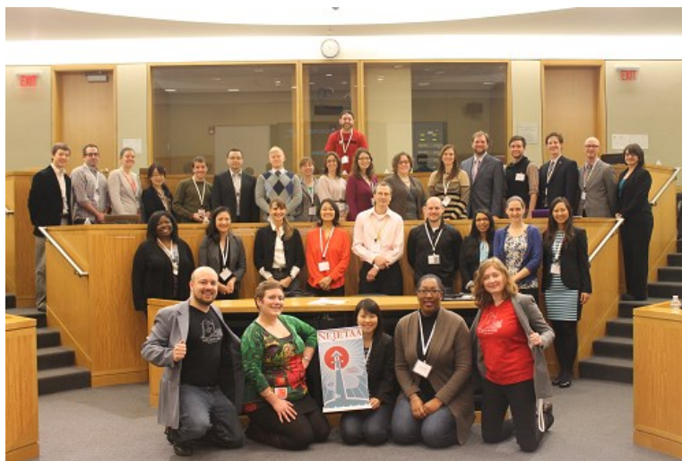
The delegates to the 2014 JETAA Regional Conference