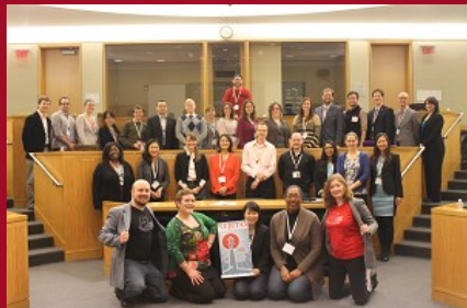
2014 JETAA REGIONAL CONFERENCE

Japan Local Government Center (CLAIR, New York) Issue no.78 March 2014