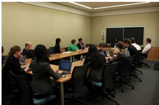
A breakout discussion about creating sub-chapters

discussion featuring representatives from Teach for America, AmeriCorps, and the University of Michigan Club of Greater Boston. Solutions found to some common problems currently facing alumni groups included organizing local events away from chapter hubs, using subchapters, and engaging people before they join, during their experiences, and after they complete their time in their respective programs. The second evening was highlighted by a delicious dinner sponsored by CLAIR at the local O Sushi Restaurant & Bar in Cambridge.