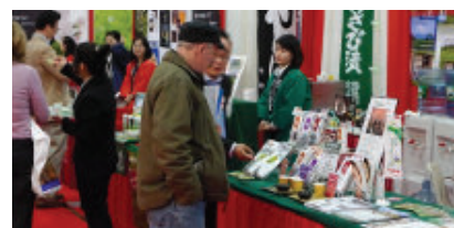
International Food and Restaurant Food Service Show

Sharing best practices with American and Canadian local governments is a high priority among Japanese local governments. JLGC supports various kinds of Japanese local government projects by facilitating study visits and arranging meetings. In order to revitalize local economies, a few Japanese local governments are trying to find new markets in North America. JLGC introduces their unique activities through showcases, events, and media sources. Some ambitious Japanese local governments have already found business partners in North America with JLGC's support.