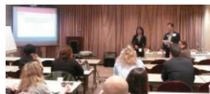
Career Forum hosted by JETAA New York Chapter

Established in 1987, the JET Program has played a significant role in foreign language education and international exchange activities. JET Program participants assist Japanese teachers in schools, and coordinate international projects implemented by local governments. JLGC continuously supports JET Alumni Associations (JETAA; 19 U.S. chapters and 7 Canada chapters) promoting and advocating the program. (Please see page 7 & 8 for details)