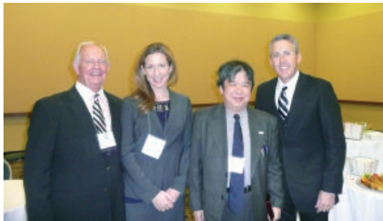
CSG National Conference 2010