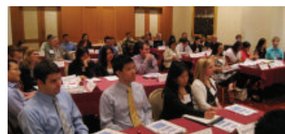
JETAA National Conference 2010 in New York

Established in 1987, the JET Program has played a significant role in foreign language education and international exchange activities. JET Program participants assist Japanese teachers in schools, and coordinate international projects implemented by local governments. JLGC continuously supports JET Alumni Associations (JETAA; 19 U.S. chapters and 7 Canada chapters) promoting and advocating the program. (Please see page 7 & 8 for details)