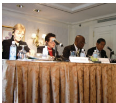
Governor Ishihara at the C40 summit, on the far right

In May 2007, the Governor of Tokyo, Shintaro Ishihara, participated in the C40 (The Large Cities Climate Leadership Group) summit held in New York. He spoke about TMG's