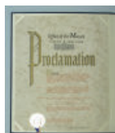
Proclamation Document 1960

In commemorating their fiftieth anniversary, Tokyo Metropolitan Government (TMG) hosted a panel exhibition in Tokyo introducing the history of exchange between the two cities with a chronological display of photographs, received gifts and mementos. Perhaps the highlight of the showing was the original proclamation document.