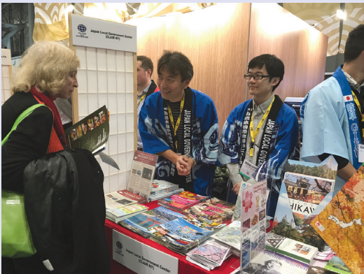
2019 New York Times Travel Show

One of the world’s largest and most successful exchange programs, the JET Programme has been sending college graduates from around the world to Japan since 1987 to teach in public schools and support internationalization, while also learning about the country. JET and its alumni associations are an invaluable resource for Japan and its relationship with the world. JLGC supports our colleagues in the Ministry of Foreign Affairs (MOFA) to promote JET and recruit highly qualified applicants, and CLAIR Tokyo is responsible for placing over 5,700 JETs in schools and government offices around Japan and supporting them during their time there.