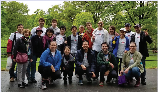
"Japan Day" cultural event at Central Park

There are now well over 70,000 JET alumni around the world, and over half of these are American and Canadian. They are served by more than 50 JETAA chapters globally, including 19 in the US and 7 in Canada, as well as many subchapters and chapters in development. The JET Programme depends on the JET alumni community to promote the program, prepare new JETs to live and work in Japan, and provide career, networking, and other support to former participants. JET alumni also “bring Japan home” to their countries after returning from Japan and are invaluable partners in teaching the world about Japanese culture. JLGC oversees CLAIR funding for alumni chapters in North America and partners with them to support a broad array of activities.