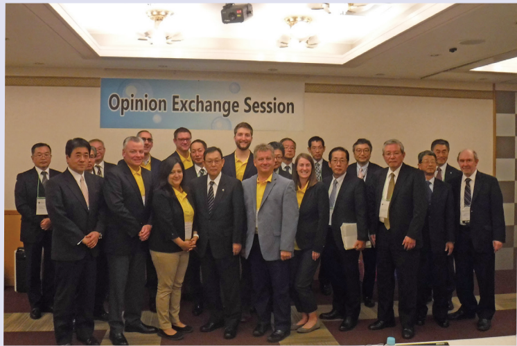
2019 Fellowship Participants in Kitaibaraki City, Ibaraki Prefecture

In order to maximize the potential for Japan’s prefectures and local governments on the world stage, JLGC works to develop a strong relationship with governments and the organizations that support them in North America. These include, in the