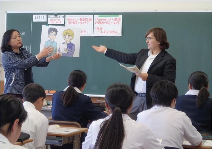
Teaching English in a Japanese School

One of the world’s largest and most successful exchange programs, the JET Programme has been sending college graduates from around the world to Japan since 1987 to teach in public schools and support internationalization, while also learning about the country. JET and its alumni associations are an invaluable resource for Japan and its relationship with the world. JLGC supports our colleagues in the Ministry of Foreign Affairs (MOFA) to promote JET and recruit highly qualified applicants, and CLAIR Tokyo is responsible for placing over 5,700 JETs in schools and government offices around Japan and supporting them during their time there.