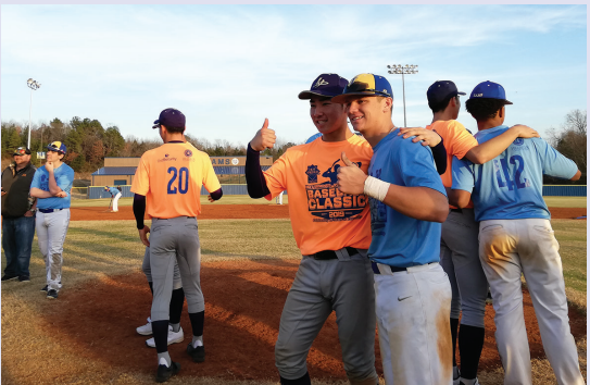
Sister city activity between Hanamaki City and City of Hot Springs

In 1955, the first sister city agreement was signed joining St. Paul with Nagasaki, and currently Japanese prefectures and municipalities have a total of 1,762 formal city and state relationships around the world. Through our partnerships with Sister Cities International and the JET Alumni Association chapters around North America, JLGC helps support the 455 relationships with the US and the 71 with Canada.