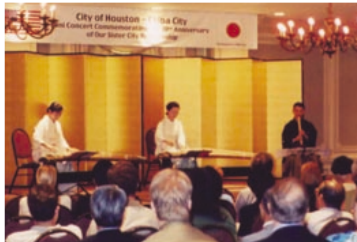
The Japanese citizens delegation and Houstonians in attendance enjoyed classical Japanese music during their anniversary celebration in Texas.

The 30 year relationship has continuously deepened, and has been punctuated by numer-