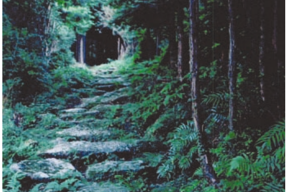
Pictured here is part of the Kumano Ancient Road known as "Kumano Kodo" in Owase City.

Mie is also the location of the Suzuka Circuit, which has become well known as a mecca for motor sports and attracts many people for international competitions including the Formula-1 Grand Prix and the Suzuka 8 hour Endurance Race. Due to the prefecture's abundant natural resources, agriculture, forestry and fishing all thrive in Mie, which is famous for Ise tea, Matsusaka beef, Ise shrimp, and Matoya Bay oysters. It is also famous around the