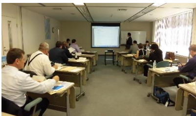
Seminar at CLAIR Tokyo Headquarters