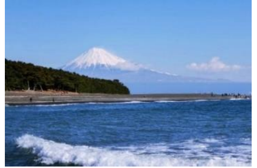
Mt.Fuji from Shizuoka City