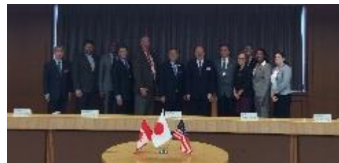
Courtesy Visit to the Deputy governor in Miyagi Prefecture

Read 2015 participants' comments and other details: http://www.jlgc.org/ http://www.jlgc.org/cms/wp-content/uploads/news84.pdf