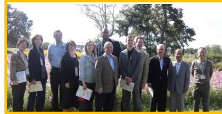
2014 in Amagasaki City