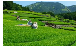
Jananese tea field