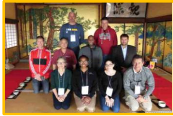
2015 in Miyagi Prefecture